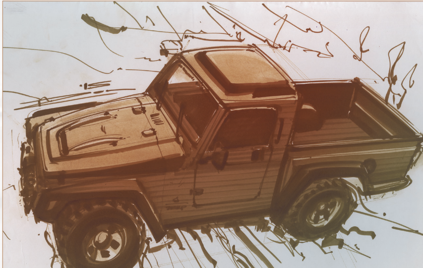
train your skills in quick marker sketching

ECTS: 3 duration: 16 weeks 4 contact hrs/week