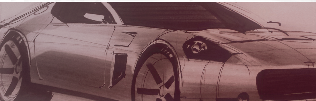
learn the principles of applying tonal value to communicate form