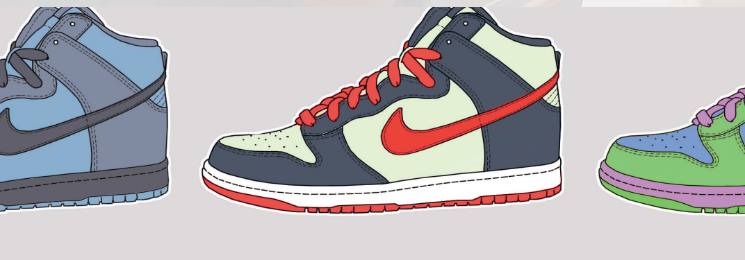
apply your knowledge of colour harmony to product design cases

The course provides background theory (e.g. Johannes Itten) and teaches how to apply hue, saturation and brightness when visualization a specific object/ arrangement/ scene. The course comprises a series of subsequent exercises in the drawing studios, and homework assignments, in which the topics of colour and visualization will be discussed, extensively exercised, and implemented in design situations. The range of media used in the course include mostly acrylic paint, and also computer and tablet (provided), and markers.