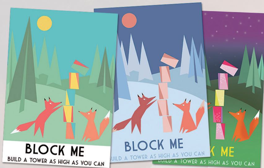
Experiment with different colour schemes for poster design

ECTS: 3 duration: 7 weeks 4 contact hrs/week