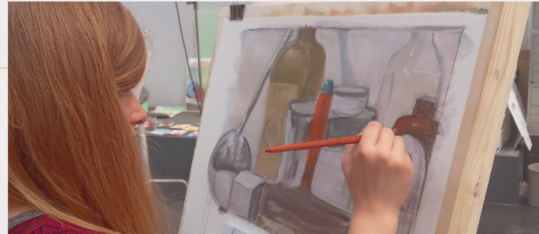
work with traditional colour media to understand pigments