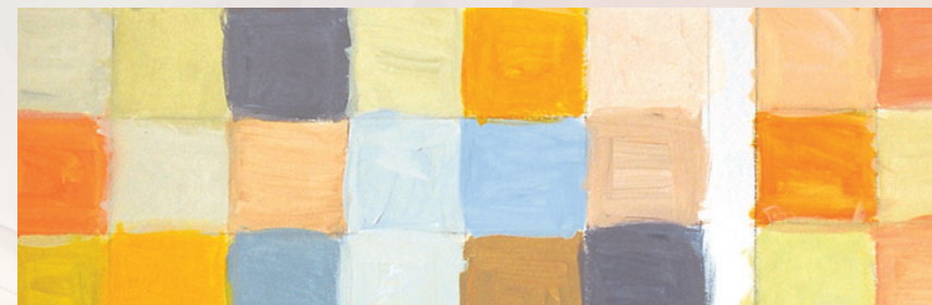
study colour relationships and get to know the basic principles of colour schemes