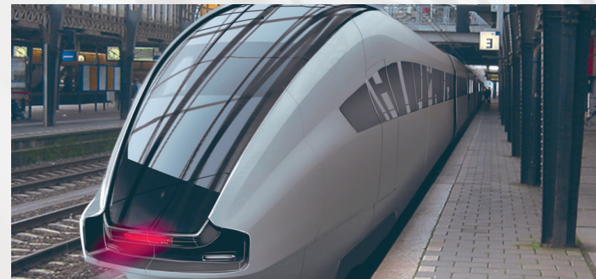
learn how to integrate photos and sketches

When running the course Computer sketching, students execute all process and drawings steps on a digital canvas, using an available (Wacom) drawing tablet and Corel Painter software. Students learn how to apply efficient steps: to start with fast line sketches, then transfer the line drawing into volumes by adding large brush effects, before turning to details. This course prepares students for working in design practice, and builds on prior knowledge and skills of analogue drawing and visualization.