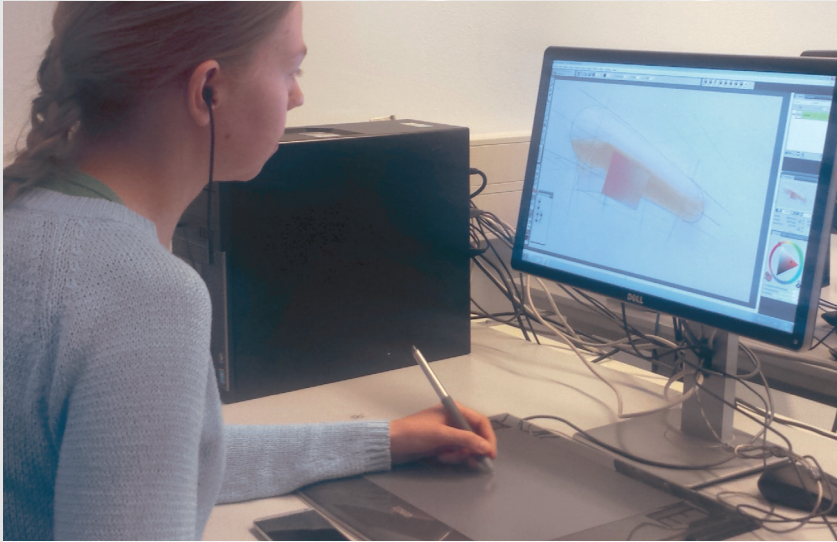
practice with digital tablet & pen

ECTS: 3 duration: 7 weeks 4 contact hrs/week