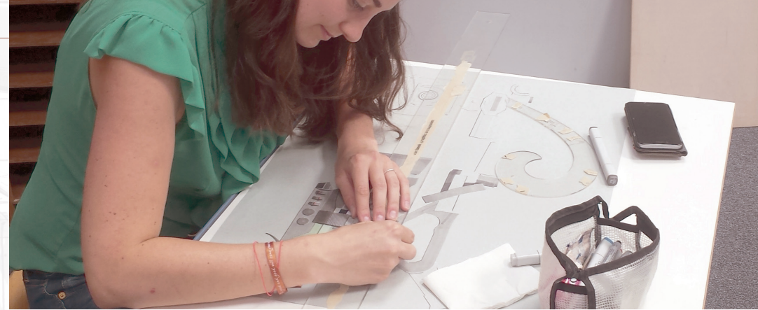
in-depth experience with various drawing tools