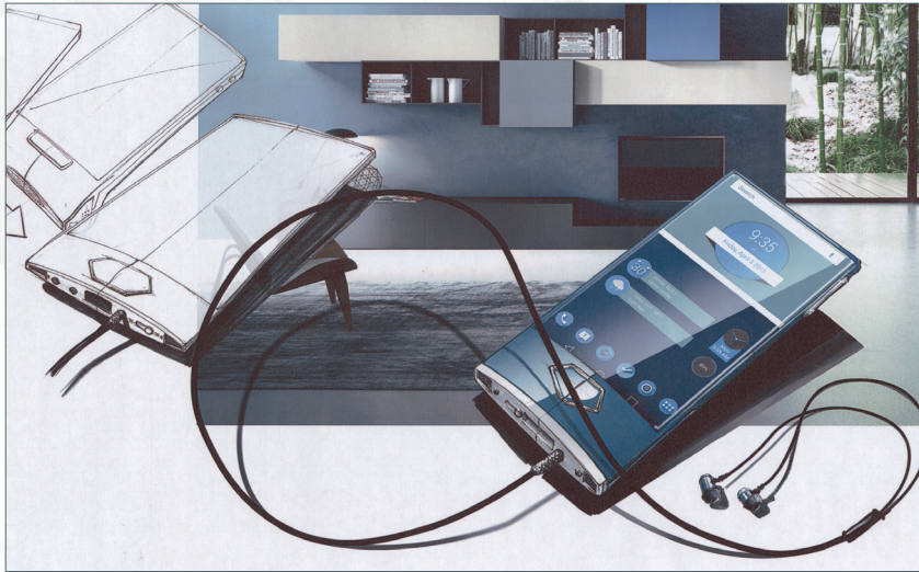
learn to present your ideation phase with quick digital tools

ECTS: 3 duration: 7 weeks 4 contact hrs/week