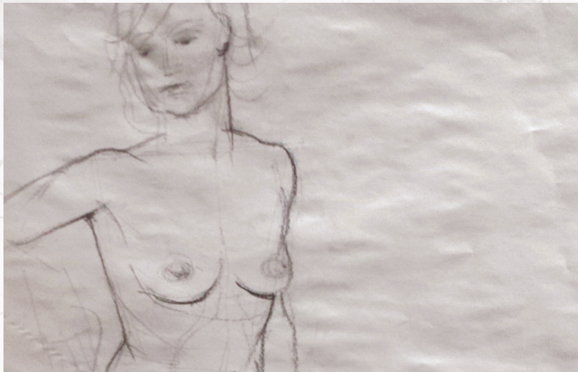
get familiar with charcoal sketching and its flexibility

ECTS: 3 duration: 8 weeks 3 contact hrs/week