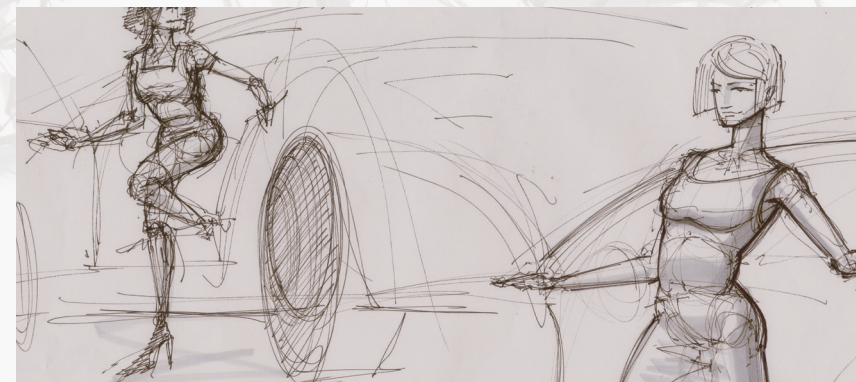
learn to quickly apply figure sketches in your ideation phase