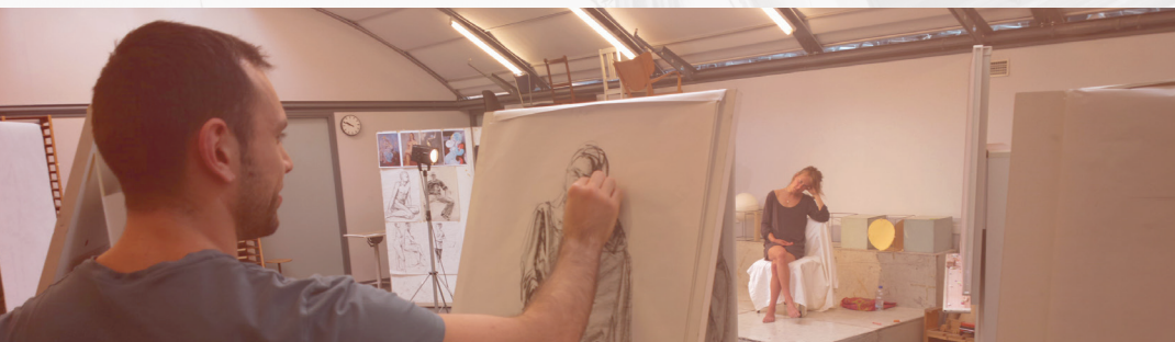
draw in the studio from live observation

During a series of weekly sessions, students are taught how to draw the various human figures and postures, with the help of theoretic background and clear instructions, and they extensively practice and develop knowledge, insights and skills, by drawing manikins and live human models in specific positions.